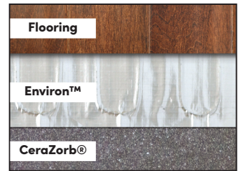
Works with TempZone and Environ Heating Systems